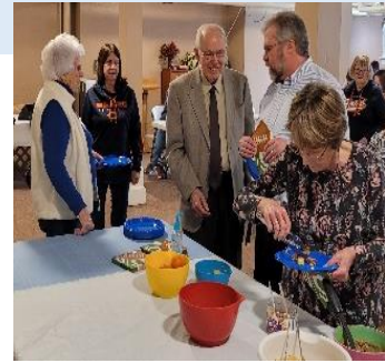
Sunday, February 18