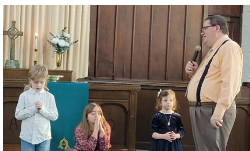
Sunday, January 21, 2024