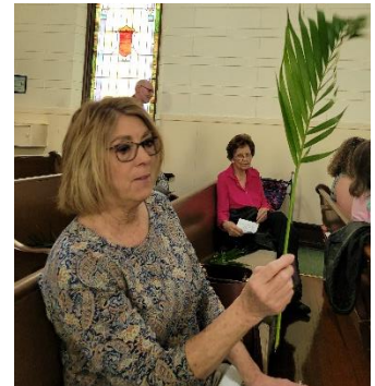
Palm Sunday, April 2. Congregation members wave palms as they sing the closing hymn, "Ride On! Ride On in Majesty!"